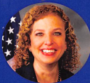
Congresswoman Debbie Wasserman Schultz Congressional Above and Beyond Award